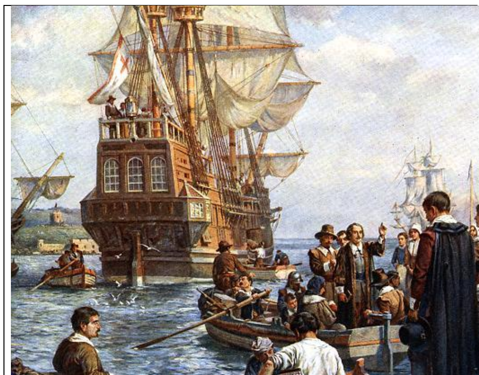
[The Pilgrim Fathers departing from Plymouth for America in 1620]