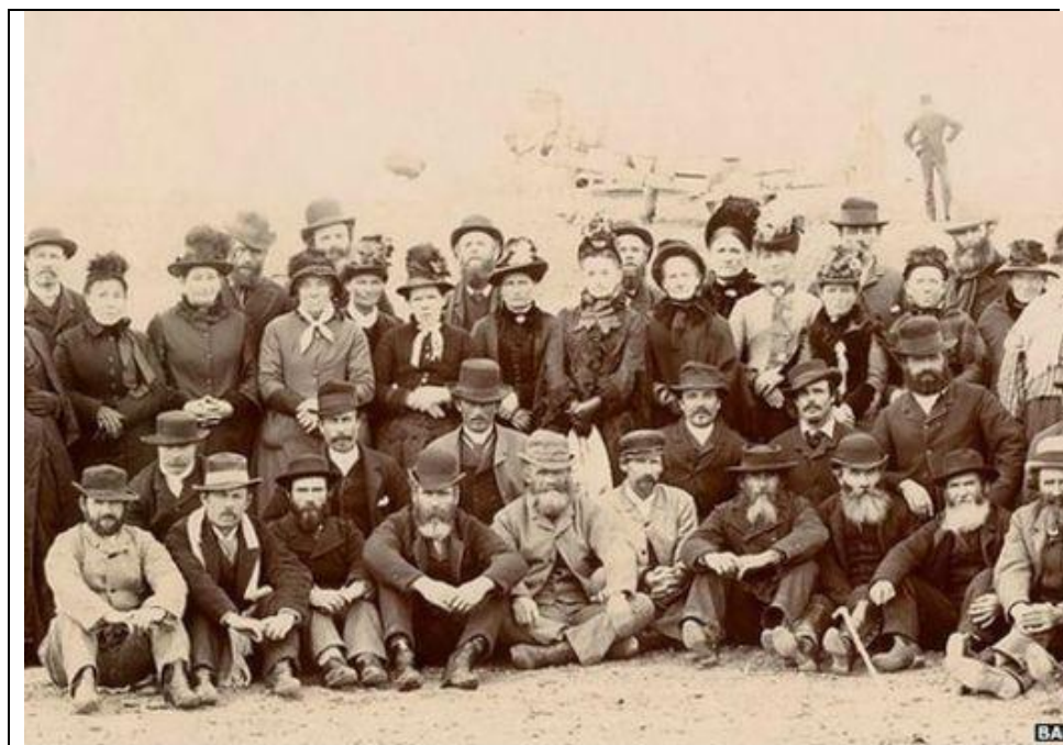
[Some of the original Welsh settlers to Patagonia pictured in 1890]

Use Sources A, B and C above to identify one similarity and one difference in patterns of emigration from Britain over time. [4]